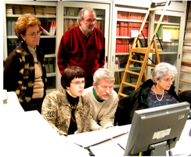
Mixed group meeting with school group, newsletter group and website group